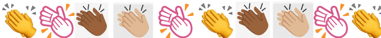
Table of Awesomeness Celebrations: Our awesome children had an awesome time on the Table of Awesomeness. Take a look at our school website in the 'Pupil Zone', under Happy Lunchtimes for some awesome photos. We're now planning our Christmas Table of Awesomeness.

Well done to the whole school for all the lovely behaviour we have seen at Lunchtimes.