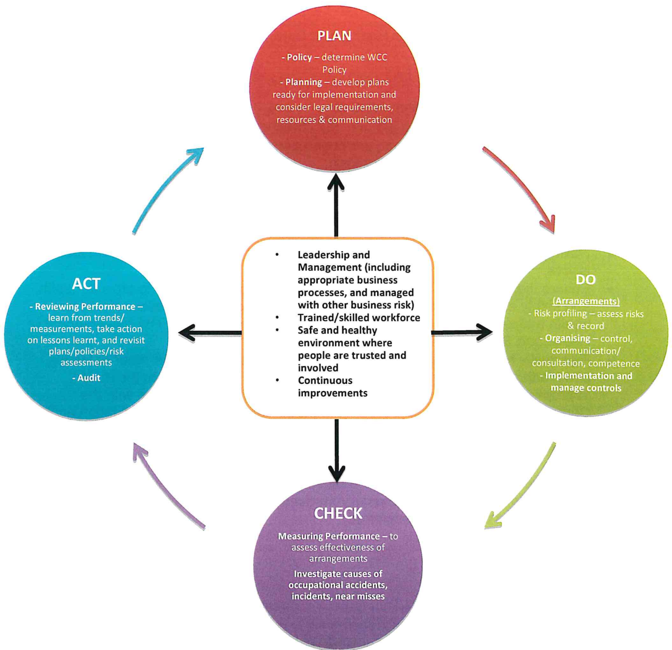
(Figure 1: WCC's in-house occupational health and safety management system)